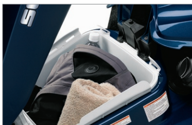
Watertight, removable storage bin