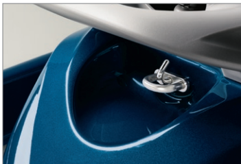
Ski tow eye