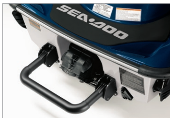
Fold-down reboarding step