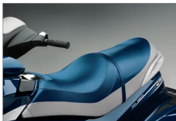
Cut & sew seat